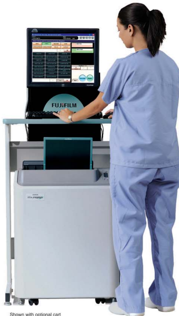
Shown with optional cart

FCR systems have proven reliability to meet the rigors of the private practice, thanks to the intelligent design and built-in redundancy features that prevents problems before they can occur. FCR's minimal contact cassette, dust cover and internal optical scanning brush prevents dust artifacts and maximizes uptime.